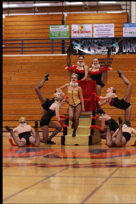
Regionals January 28th, 2012 Westview High School