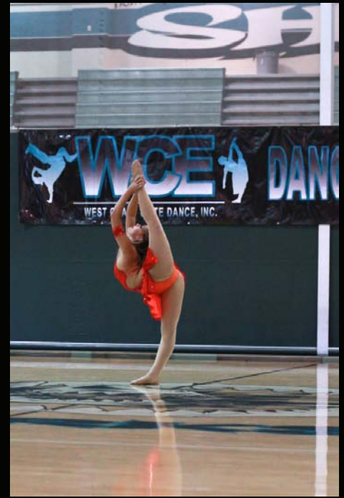
February 11th, 2012 Westlake High School