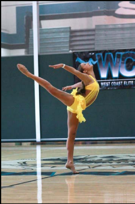
January 21th, 2012 Valencia High School